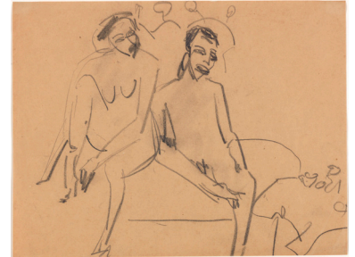
Ernst Ludwig Kirchner , Nacktes Paar im Atelier (Nude Couple in the Artist's Studio), 1910, chalk on paper, 33 x 42,7 cm